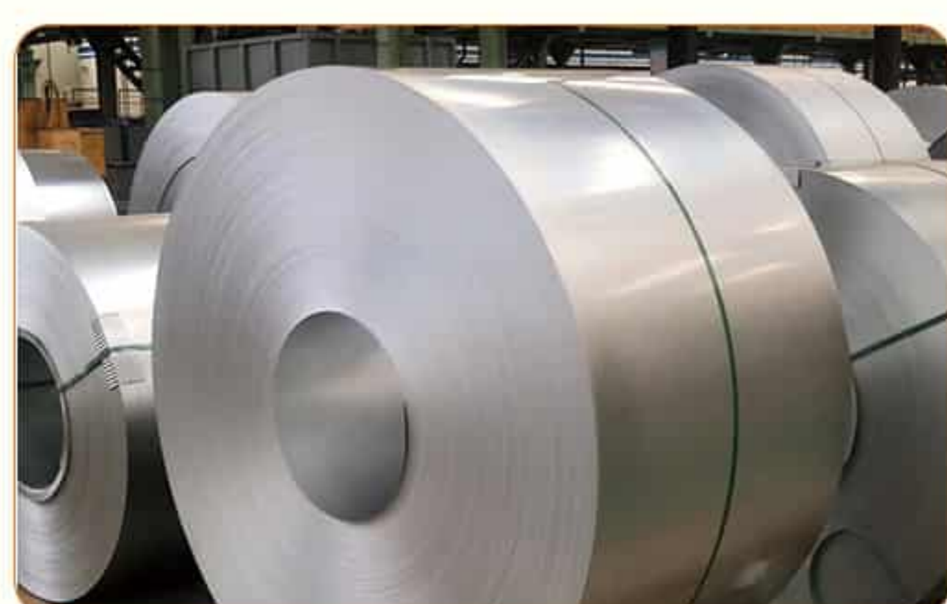
1.彩涂基板 Basic plate of PPGL

镀铝锌板，具有良好的耐腐蚀性和延展性，有利于深加工等特点。主要用于建筑、汽车、交通及家电等领域，特别是钢结构建筑等行业。According to the high performance characteristics of corrosion resistance and eoxtensibility as well as excellent further processing, GL is mainly adopted for construction vehicle, transportation and household appliances,especially for the steel structure construction and relative fields.