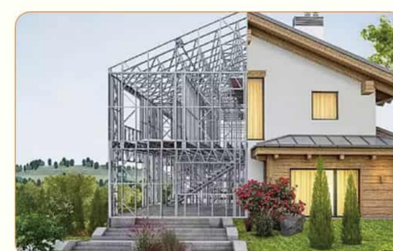
2.建筑板、民用家电板 Constructions and civil usage for household appliances such as ventilation pipe, piping coating and washing machine.oven.