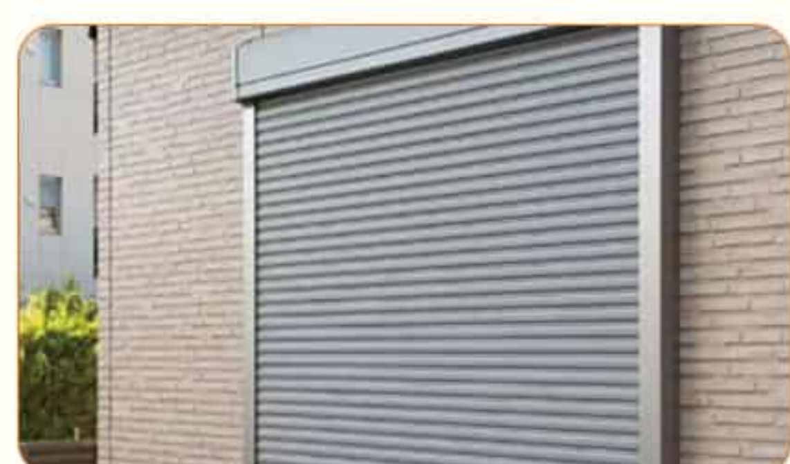
1. 彩涂基板 Basic plate of PPGI.

According to the high performance characteristics of corrosion resistance and extensibility as well as excellent further processing HDGI/GI is mainly adopted for construction, vehicle, transportation and household appliances, especially for the steel structure construction and relative fields.